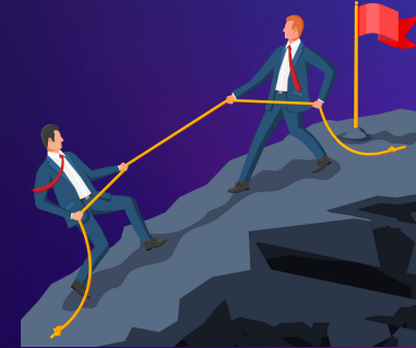
Lobbyist & Consultants